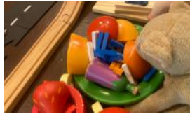
SCAT EATS HIS ENERGY SOUP