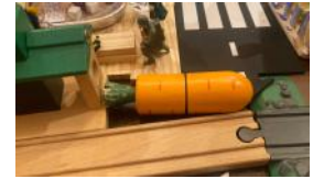
GIANT CARROT TRANSPORTED FROM IGGY & PRICKLES .CO