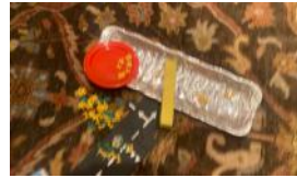
ETHANLISH PROTOTYPE BATTLE SHIP IN HANNAHLISH PORT