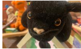
GENERAL VELVET ON ROOF OF BLUE EYES AND EMILY'S HOUSE